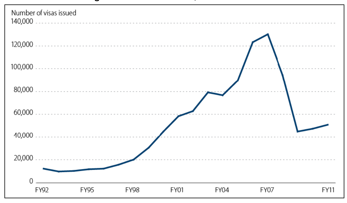
Figure 2. H-2B Visas Issued, FY1992-FY2011